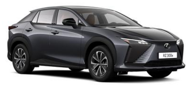
Sonic Grey (1L1)