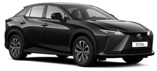
Graphite Black (223)