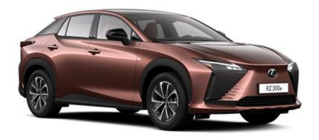
Sonic Copper (4Y5) *